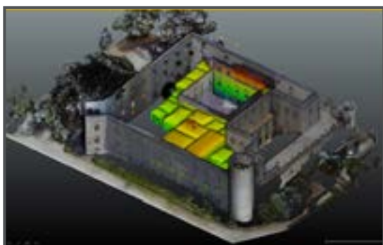
Image showing merged indoor and outdoor datasets

Saving you time and money – you can capture and model complex data up to 10 times faster, enabling you to successfully complete projects in minimum time with little or no disruption at the project site. With proven ability to scan faster than traditional surveys or static terrestrial laser scanning, you can reduce scanning time, in many cases by half. Customers often find that the ZEB-REVO is highly complementary to their existing scanning hardware, as the combination allows indoor handheld scanning to take place at the same time as the outdoor scanning, saving project time and money.